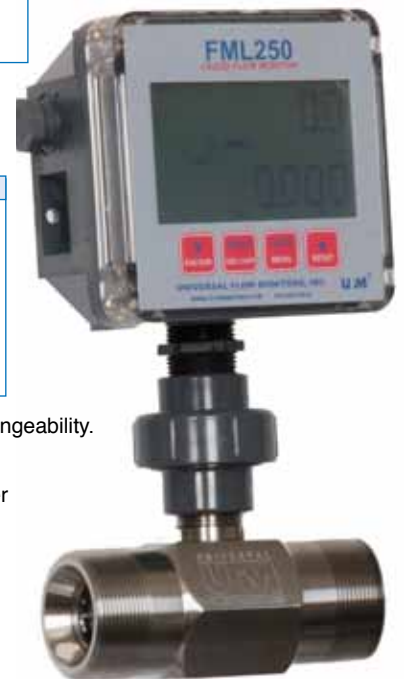
FML ENCLOSURE MOUNTED ON HA METER

Note: These meters are typically ordered with attached flow monitor display (See FML250 data sheet). By putting this FML250 part number at the end of the model selected, it will come installed on the meter and pre-configured for k factor Eg. HA0300-FML250-P-SM.