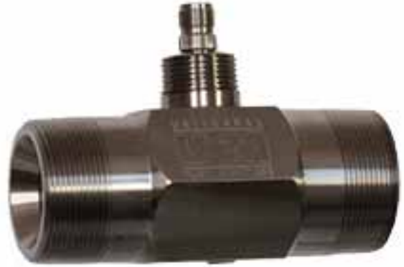
HA HIGH ACCURACY TURBINE

Every flow meter has a unique K-factor and is documented by means of NIST-traceable factory, independent laboratory, or bench calibration processes.