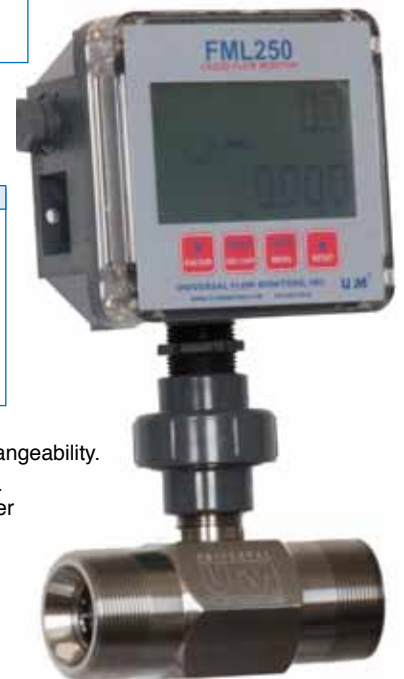
FML ENCLOSURE MOUNTED ON HA METER

Note: These meters are typically ordered with attached flow monitor display (See FML250 data sheet). By putting this FML250 part number at the end of the model selected, it will come installed on the meter and pre-configured for k factor Eg. HA0300-FML250-P-SM.