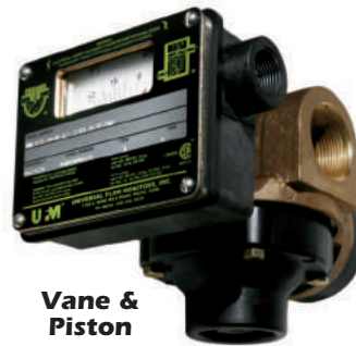
Vane & Piston